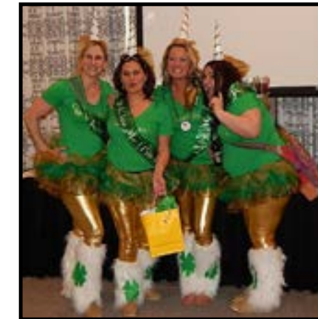
The O'Shananigans had the best team score at the Putt-n-Pub.

Holes were located at Rushmore Hotel & Suites (formerly Adoba eco Hotel) Sanfords, Thirsty's, Murphy's Pub, 445 Lounge, Paddy O'Neill's Irish Pub & Grill, Suzie Cappa Art Center, Independent Ale House, the VFW and Press Start Retro Arcade Bar. Proceeds from the event will go toward renovating the Black Hills Works gymnasium to be better suited for Special Olympics.