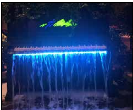
This fountain piano was created by RPM Companies.

Community Connection Awards Both the Rapid City Fire Department and the Rapid City Police Department were honored for their extra efforts to meet the unique challenges of the people we support by developing relationships with both staff and